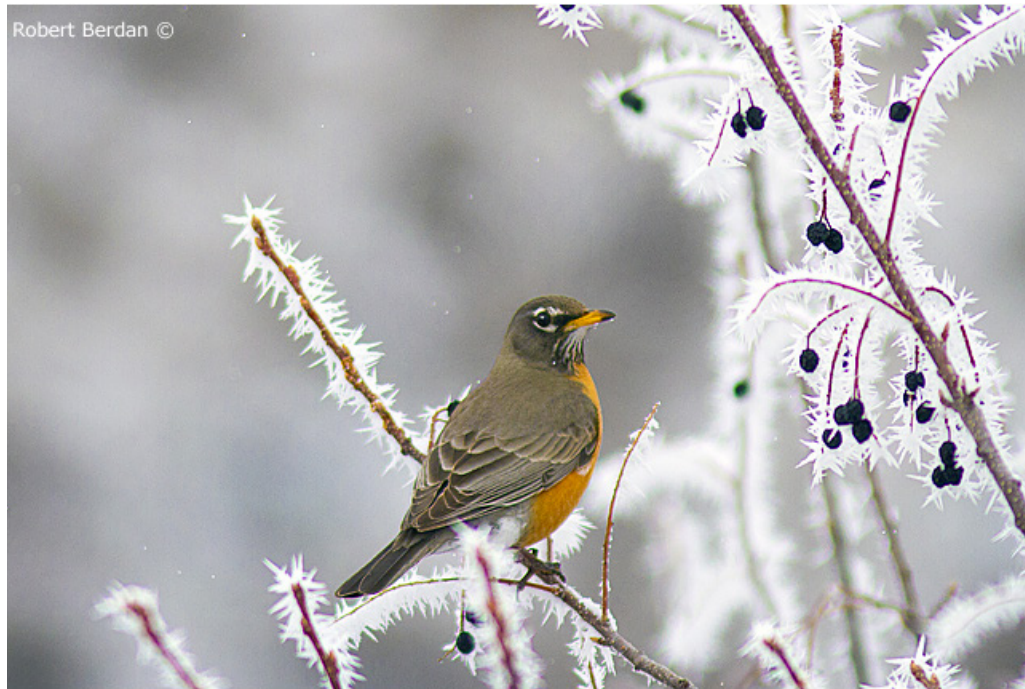
Winter Picture: Hoar Frost

See www.dtcenter.org for information about the DTC-related presentations, DTC Visitor Program, the DTC newsletter archive, DTC directory listing and more. ■