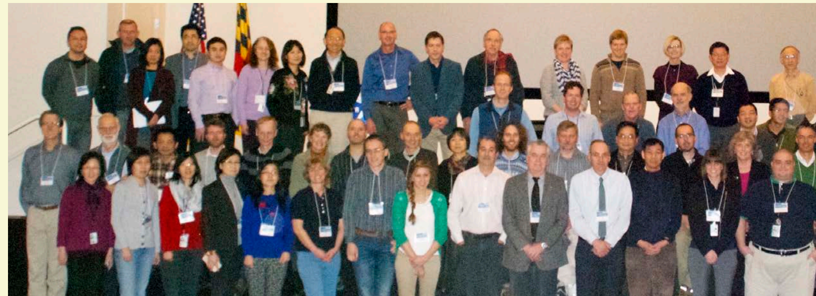
Workshop attendees for the workshop on Parameterization of Moist Processes for Next-Generation Weather Prediction Models (large photo is split on pages 4 and 5).