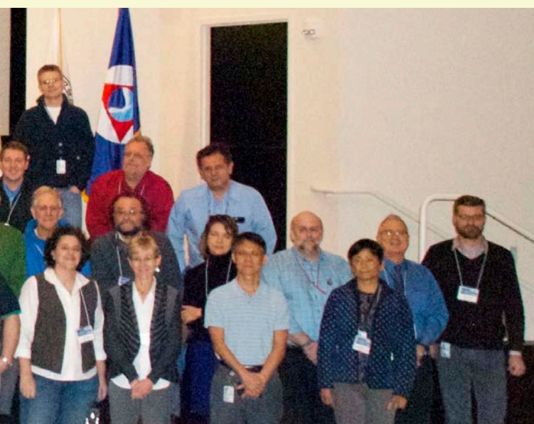
Workshop attendees for the workshop on Parameterization of Moist Processes for Next-Generation Weather Prediction Models.